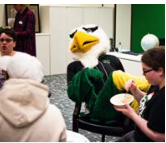
Scrappy enjoying the open house