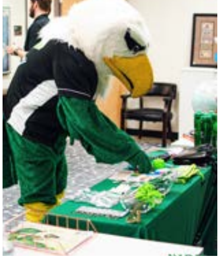
Scrappy enjoying WGST and INST merch