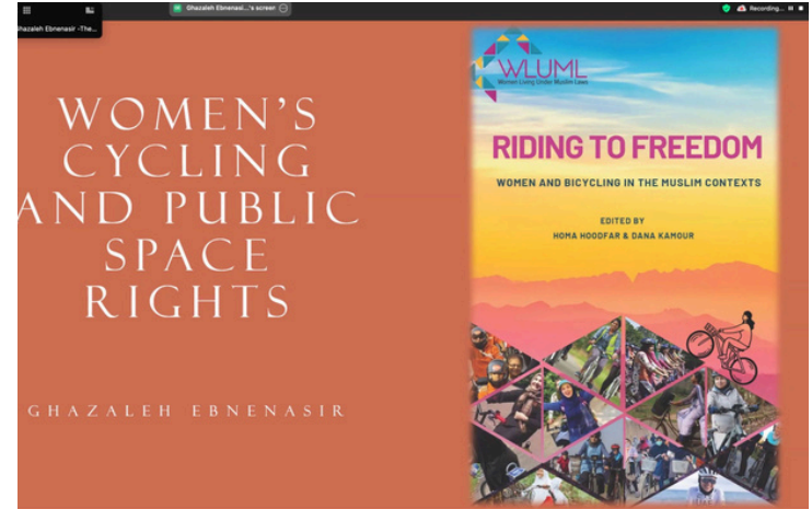
Ghazaleh's Presentation Title Slide