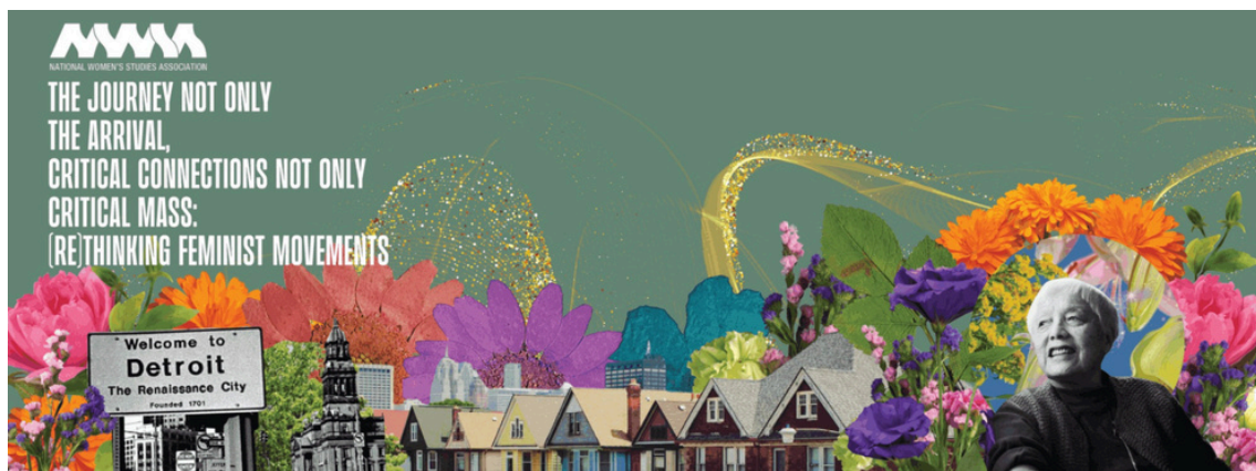
National Women's Studies Association 2024 Conference Banner