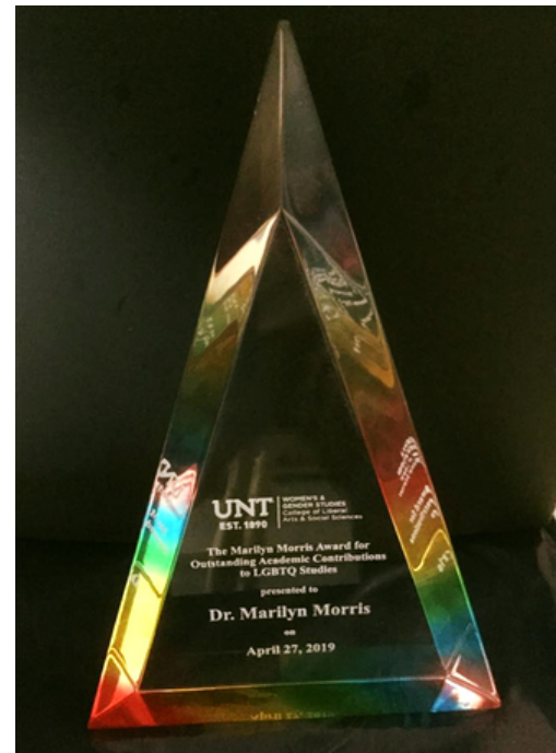
The Dr. Marilyn Morris Award (Pictured in 2019)